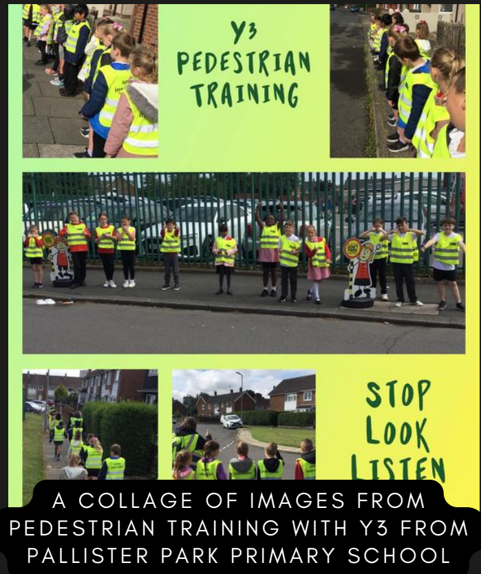
A COLLAGE OF IMAGES FROM PEDESTRIAN TRAINING WITH Y3 FROM PALLISTER PARK PRIMARY SCHOOL

We'll welcome our Active Travel team back in September when the school year begins. As always, remember to Stop, Look, Listen and Think when it comes to crossing the road!