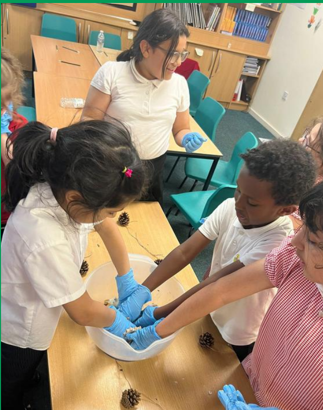
STUDENTS FROM ABINGDON PRIMARY SCHOOL MAKING BIRD FEEDERS AT THEIR NEW CLIMATE ACTION CLUB

This photo was taken from the second session, the last of the school year, where the students took part in making bird feeders: The Climate Action Clubs will return in September with the new school year, and CAM can't wait to return!