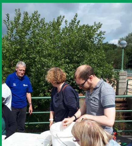
ROOTED IN NATURE SERVICE USERS GETTING INVOLVED WITH COUNTING AND MEASURING ELVERS AT TEES BARRAGE