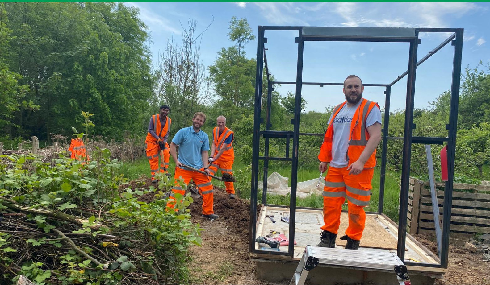
CONTRACTORS FROM STORY CONTRACTING WORKING ON THE BRAND NEW COMPOST TOILET, HERE ON THE GROUNDS OF MIDDLESBROUGH ENVIRONMENT CITY OFFICES