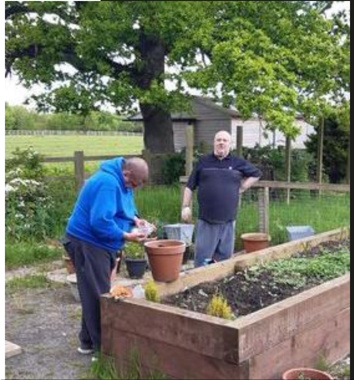
TWO SERVICE USERS FROM ROOTED IN NATURE TENDING TO THEIR HOMEGROWN POTATOES

This activity provides the service users with growing skills, as well as exercise from tending the plants, and is a great, simple way to get out, about and connected with nature!