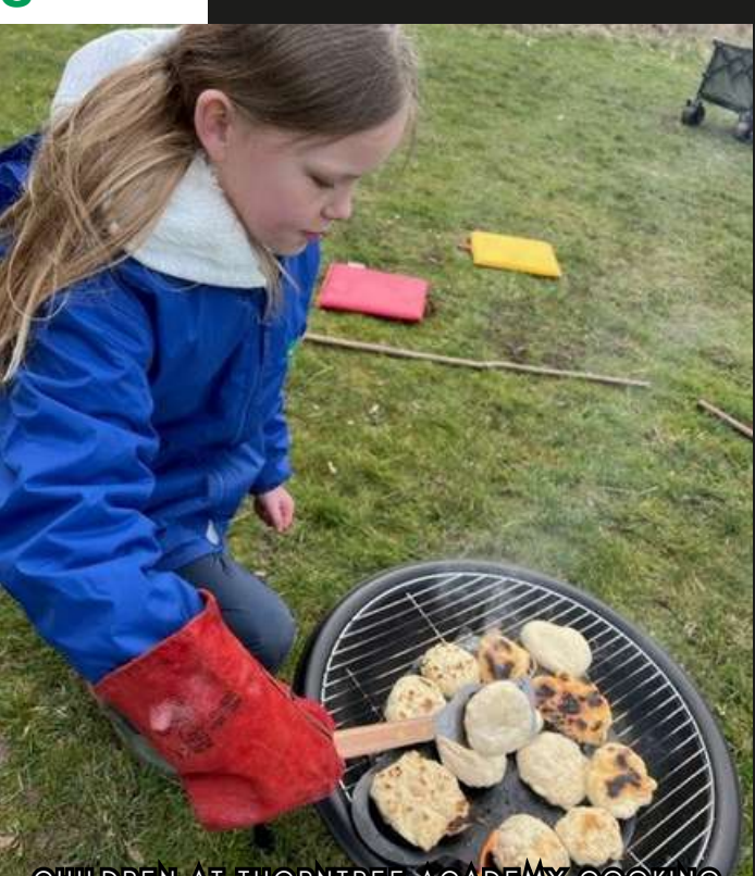
CHILDREN AT THORNTREE ACADEMY COOKING FLATBREADS IN THE GREAT OUTDOORS UNDER GUIDANCE OF OUR FOREST SCHOOLS TEAM

Boro Active Explorers have continued to run weekly sessions for groups of children from local schools, encouraging them to be active, explore and look after the world around them and to develop new skills. Recently the children used hand drills to make bird feeders and enjoyed making and cooking bread on the fire.